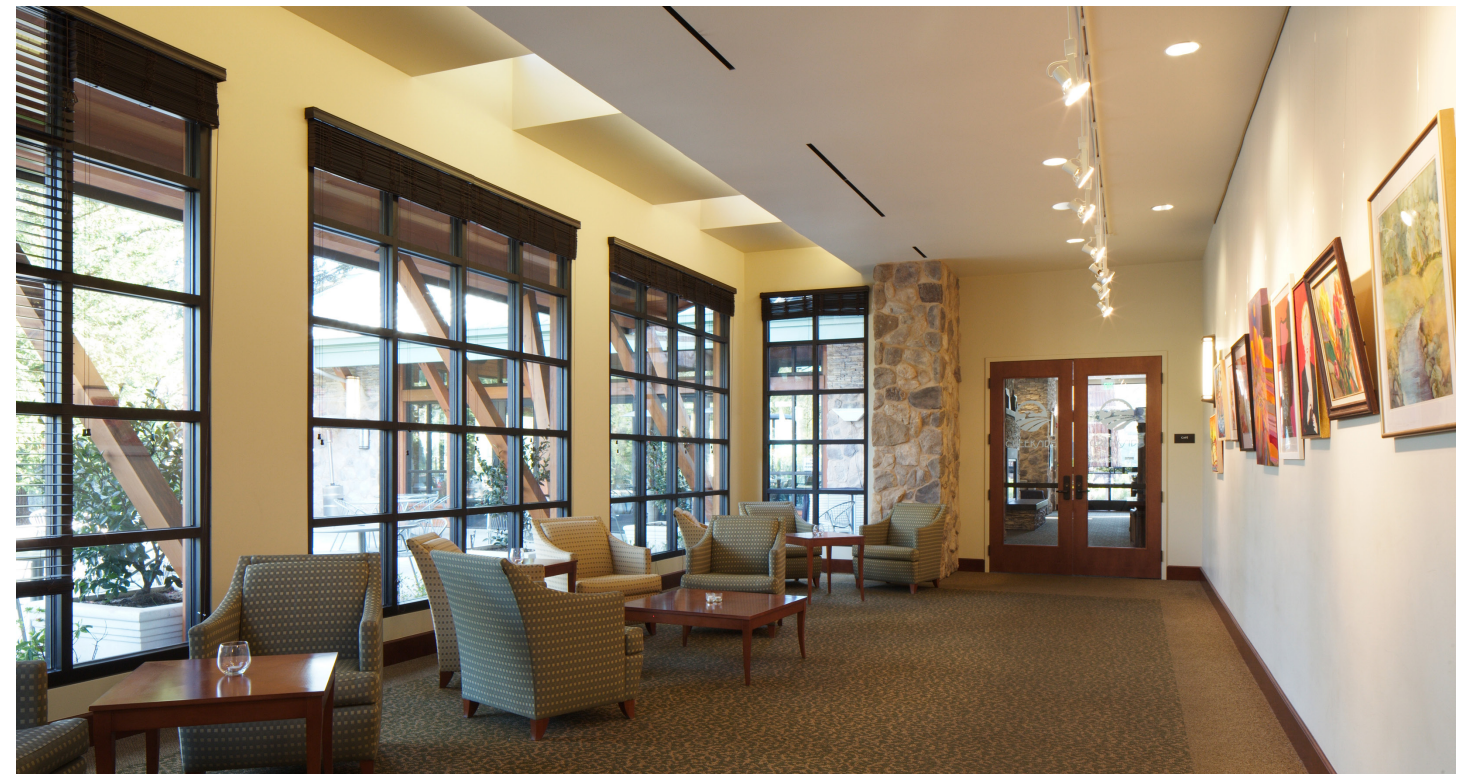
Naturally-lit corridors double up as galleries to which a display of local artwork livens the transitional spaces connecting major activities and functioning areas of Creekside Clubhouse.

Table tennis was an active use that would be better served and accessible there. Demonstrating the intent and purpose behind the move, allowed for a much better design of the new Creekside Clubhouse. The exercise of a suitability analysis served as the basis for defining the facility programs.