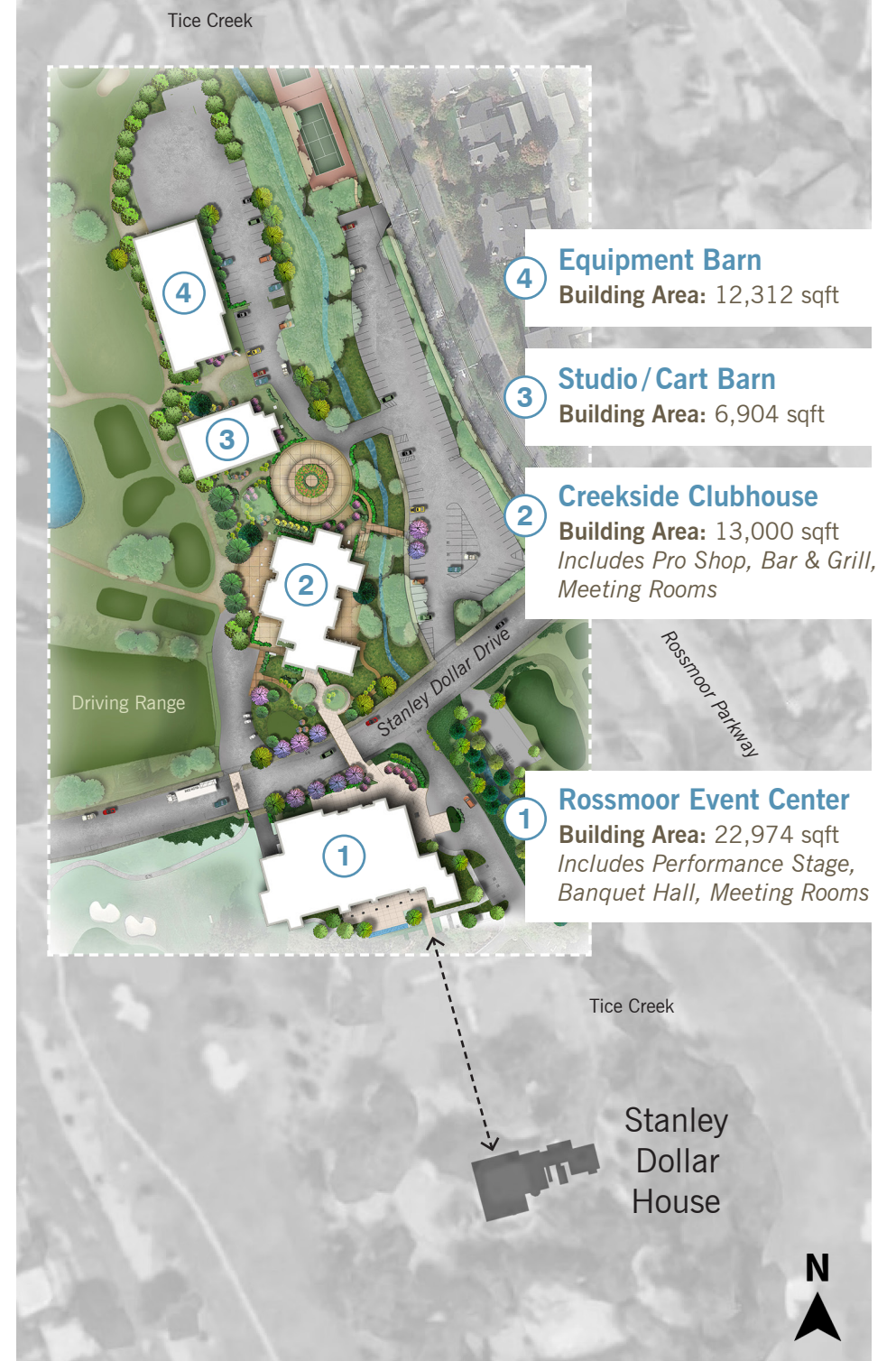
Situated at the intersection of Rossmoor Parkway and Stanley Dollar Drive, Rossmoor's Creekside Complex is at the heart of the 1,800-acre gated, senior living community.