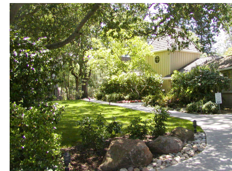
Existing outdated structures are surrounded by beautiful large heritage trees.