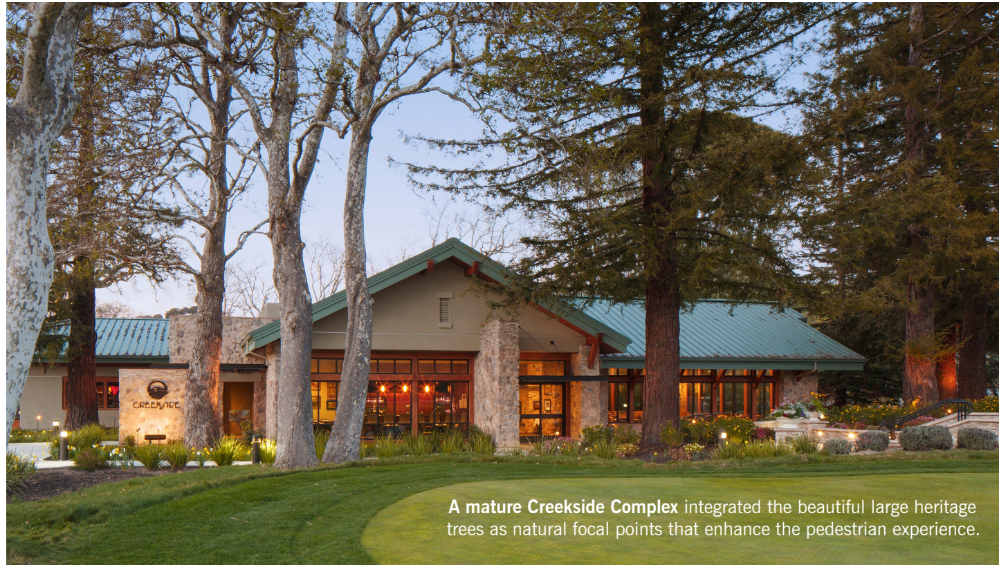
A mature Creekside Complex integrated the beautiful large heritage trees as natural focal points that enhance the pedestrian experience.