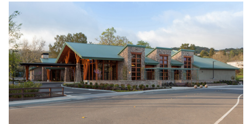
The roadway narrows for safe pedestrian crossing, marked by stone bollards, street flashers and a change in paving.

wellness and exchange was key to the fundamental design intent of creating a vibrant social center complex at the heart of the Rossmoor community.