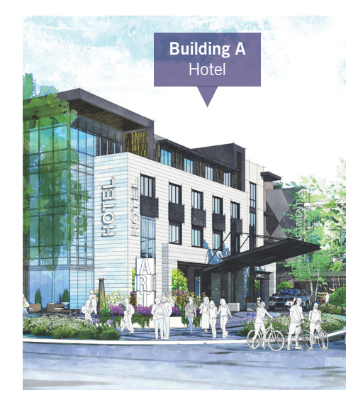
A contemporary hotel with modern rooms and amenities ideal for the business traveler.

Since much of the uncertainty affecting the design is dependent upon the City's vision, neighbors, Cupertino residents and public officials and staff, DAHLIN preserved project momentum by tightly managing response times. Achieved using a flexible design approach informed by active listening to enable quick turnarounds between iterations, this solution is a blend of science and art -- process as the science, and experience as the art, particularly DAHLIN's experience working collaboratively with municipal planning commissions.