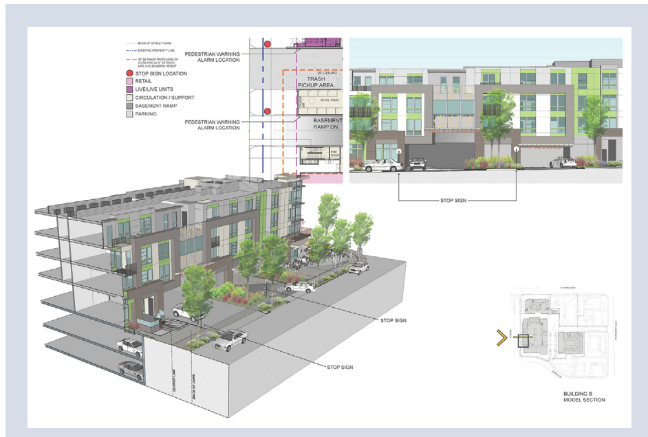
Retail and restaurant patrons will have the option to surface park on the main street or within the adjacent ground level parking garage.

Retail and restaurant patrons will have the option to surface park on the main street or within the adjacent ground level parking garage of Building B while all the residential and hotel parking is below their respective buildings. As a result, the entitled design now has a lower traffic impact than the current usage.