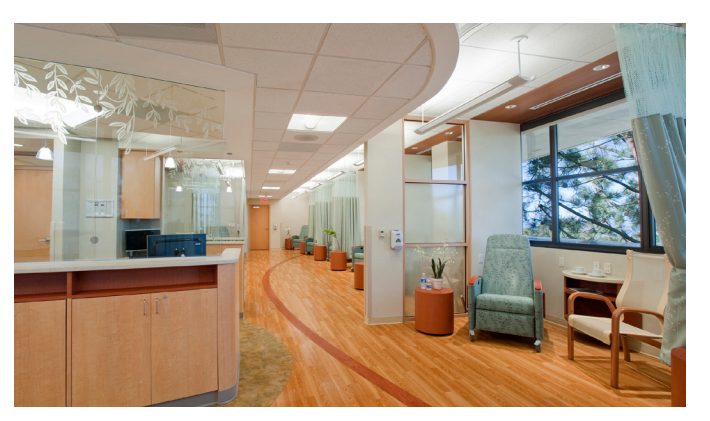
Patient stations maximize outdoor views in an open-bay concept supported by a curtain wall track system that provides psychological spaciousness and patient privacy within an open floor plan.