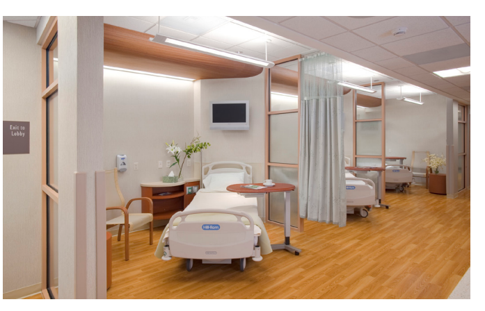
45-degree bay angles increase the efficient use of space, directional maneuverability, and patient privacy.